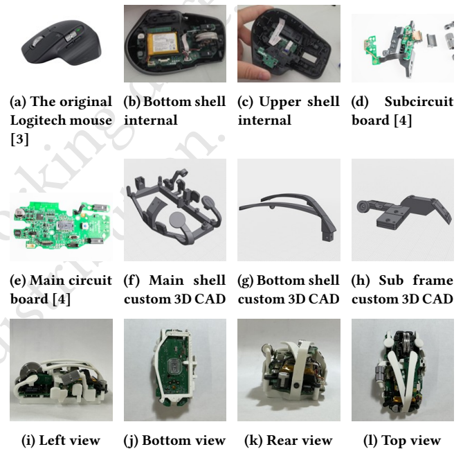
Figure 1: Overview of the original and custom mouse components

The approach not only empowers users to address planned obsolescence challenges but also provides researchers with a scalable platform for prototyping specialized input devices in assistive robotics and human-machine interaction applications.